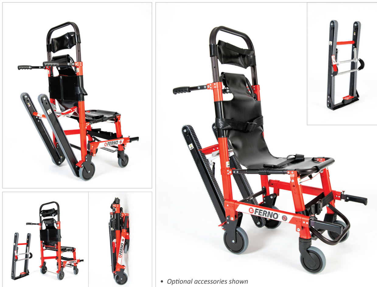
• Optional accessories shown